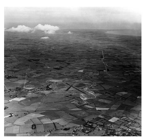
RAF Leconfield from the air in May 1945

flew its first combat mission on 13 January 1943, and 196 Sqn on the night of 4/5 February. However, 4 Group was re-equipping to become an all-Halifax unit, so the Wellingtons were phased out.