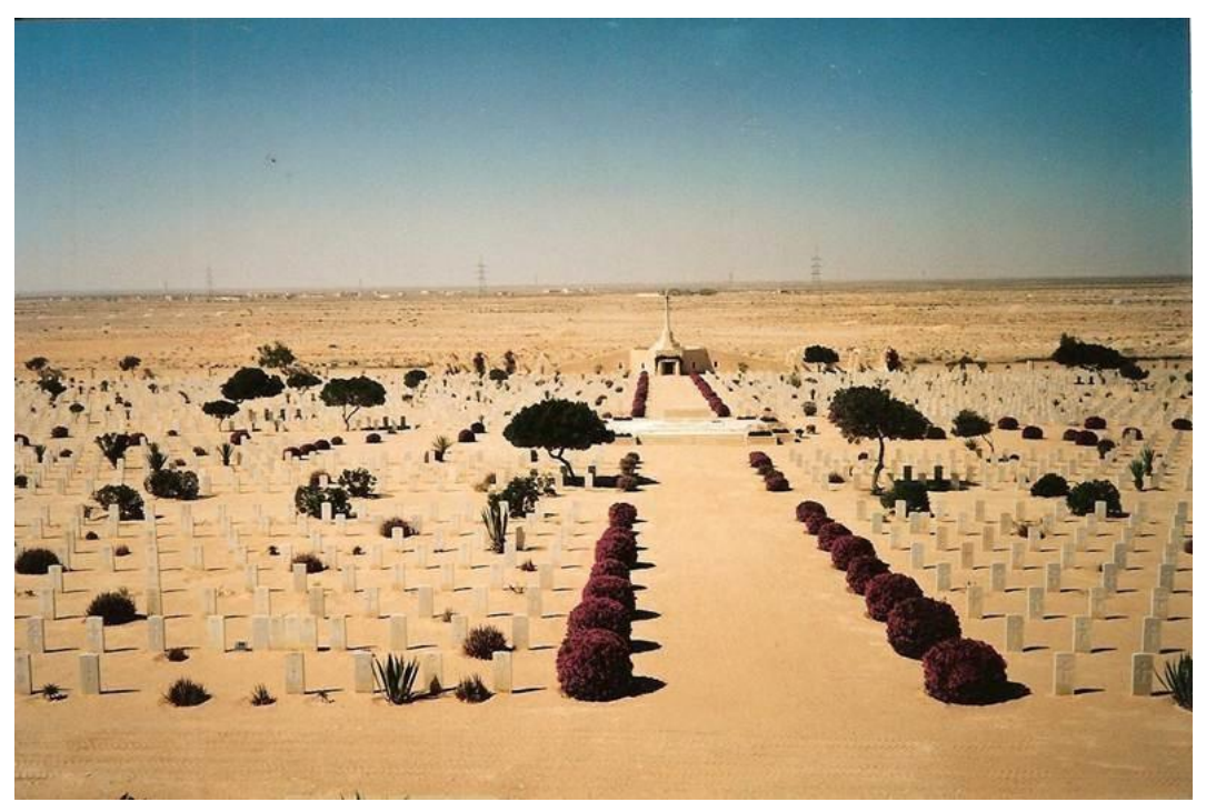
Commonwealth War Cemetery at El Alamein.

containing the graves of 7,354 of the identified soldiers. A twenty hectare sea of headstones in row upon neat row, set in the golden sand - far too hot for grass here - the stark lines softened by small, clipped, purple bougainvillea bushes, all flowering profusely, and aloes. But apart from the barren beauty and peace of the place, we were dumbfounded by so many soldiers buried here, so far from home in such a hot, hostile environment. Awesome and awful.