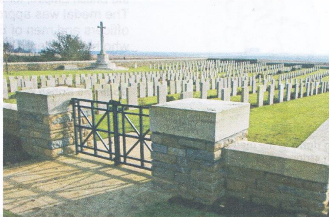
Commemorated in perpetuity by the Commonwealth War Graves Commission

Remembered with honour BERTRANCOURT MILITARY CEMETERY